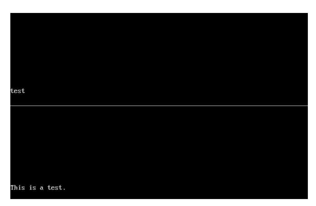
Figure 13-7. Two users in a talk session

If you specify just a username, the chat request is assumed to be local, so only local users are queried. The ttyname is required if you want to ring a user on a specific terminal (if the user is logged in more than once). The required information for talk can be obtained from the w(1) command.